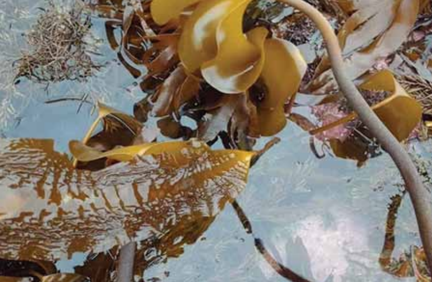
Sweet Kelp; Tangle or Forest Kelp

elements and vitamins. But be careful - it is often to be found in abundance close to sewage outflow.