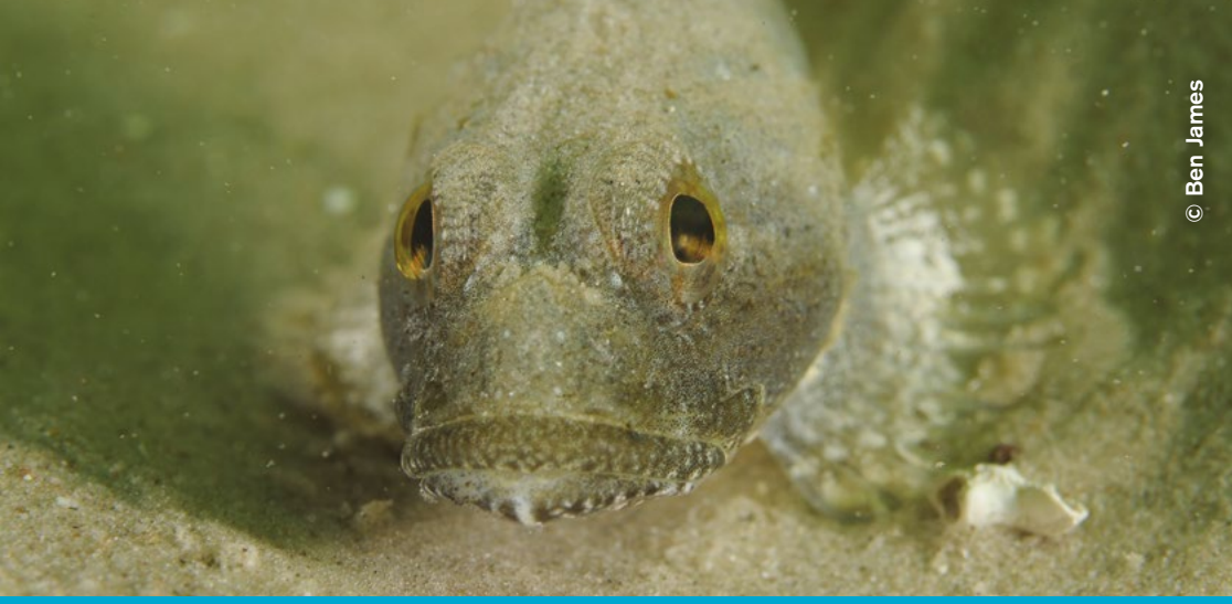
A short-spined sea scorpion on the sandy sea bed