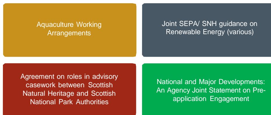
Figure 1. Protocols relevant to joint-key agency working on development proposals

Where a case raises issues of joint interest we will work closely with other key agencies (see Figure 1) to solve problems and, where possible, enable a proposal to be progressed. We will ensure that our customers receive complementary, rather than contradictory, advice.