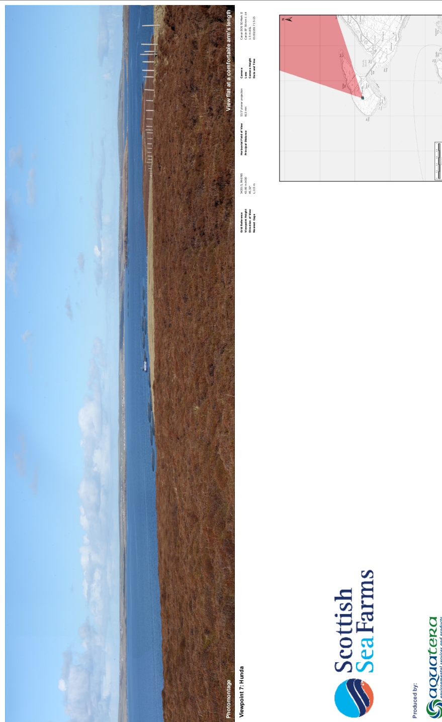
Figure LV13g: Viewpoint 7 panoramic cumulative photomontage