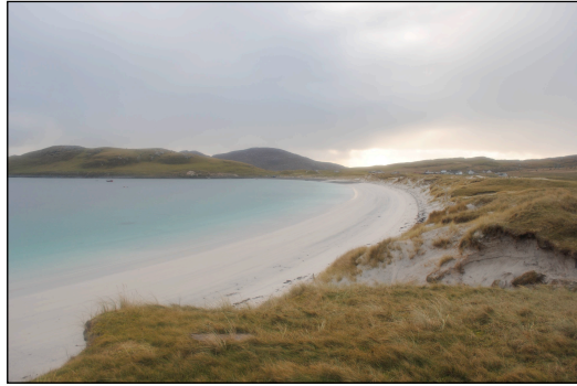
Sheltered Bay with Beach (1) LCCA