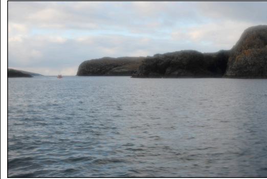
Indented Coastal Edge LCCA