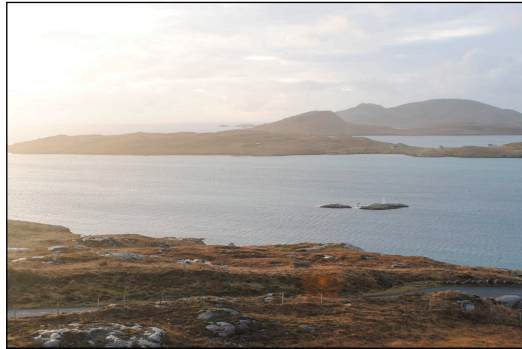
Narrow Peninsula LCCA