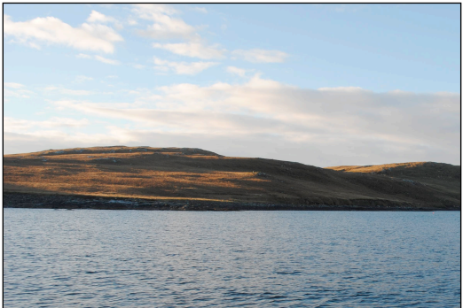
Moorland Coastal Edge LCCA