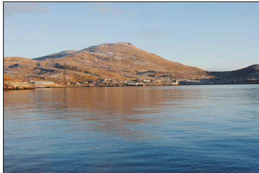
Settled Sheltered Bay LCCA