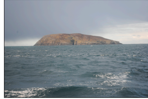
Rocky Moorland Islands LCCA