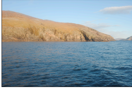
Rocky Moorland Coastal Edge LCCA