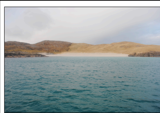
Sheltered Bay with Beach (2) LCCA