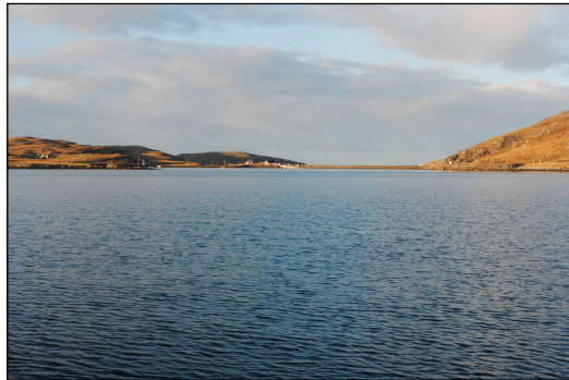
Sheltered Bay LCCA