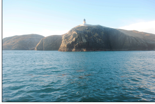
Rocky Moorland Headland LCCA