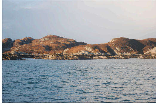
Enclosed Sea Loch Mouth LCCA