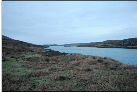
Enclosed Inner Loch (1) LCCA