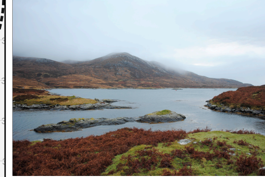
Enclosed Inner Loch (2) LCCA