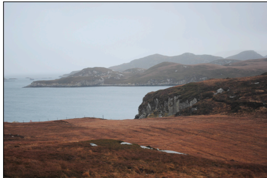
Indented Outer Sea Loch LCCA