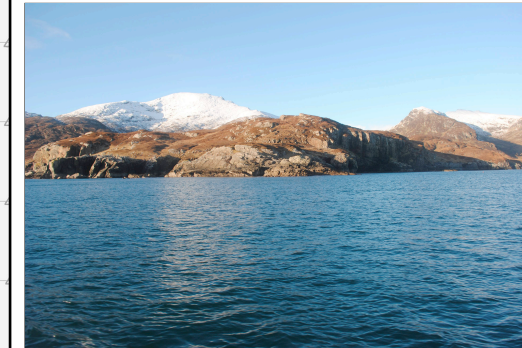
Steep Sided Coastline LCCA