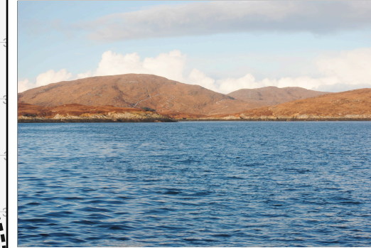
Sea Loch Mouth LCCA