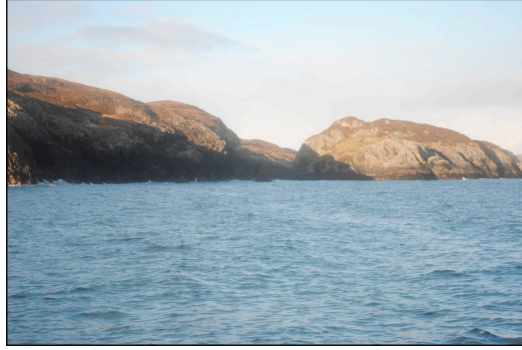
Rocky Indented Coastline LCCA